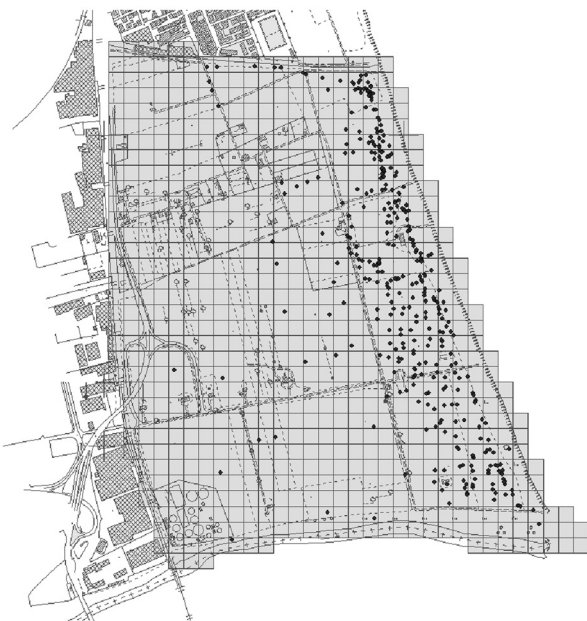
Fig. 2 - Illustration of the division of the territory of the 'Sentina' Regional Natural Reserve divided according to the sampling 'cells' (50 × 50 m). The symbols correspond to the information on the presence of the plant species considered.

For the period from 2007 to 2009, R. peltatus subsp. baudotii was exclusively reported for a depression that was periodically flooded, and was located near the north entrance of the Natural Reserve, between the road and the cultivated fields. This was no longer detected in the recent survey, probably due to the exten-