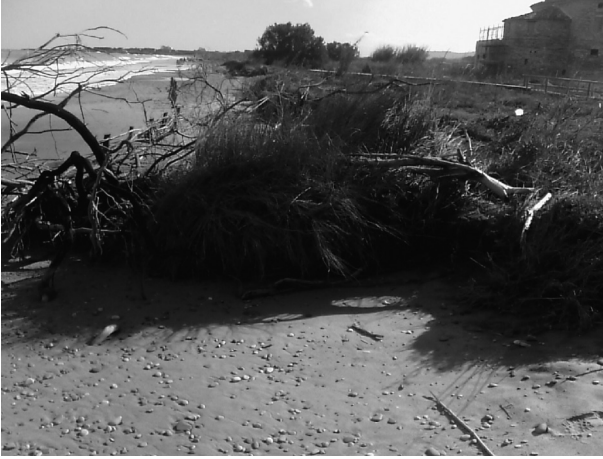
Fig. 5 - Foliage of Spartina versicolor directly exposed to the force of the sea.

present previously. This trend can be considered in the framework of the adaptive response of S. versicolor to coastal erosion. After 2012, the situation indicated for E. juncea subsp. juncea above is also relevant to S. versicolor (Fig. 5).