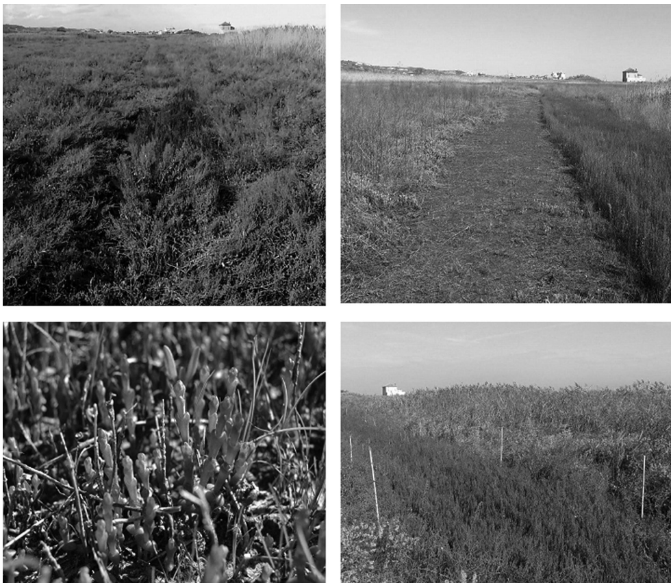
Fig. 7 - Evolution of the study area for the thinning of Halimione portulacoides that was carried out to favour the recovery of Salicornia perennans subsp. perennans .

The overlapping of historical images has shown the continuous retreat of the coastline throughout the Natural Reserve (Fig. 8). In quantitative terms, this retreat was measured according to the 5 th century 'Harbour Tower', and it has resulted in a loss of about 140 m since 1961, 100 m since 1976, 70 m since 1994, and 25 m since 2009. This translates into a speed of coastal erosion that in the first two recorded periods was