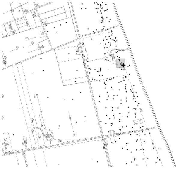
Fig. 3 - Detail of the territory of the 'Sentina' Regional Natural Reserve illustrating the presence of Artemisia caerulescens subsp. caerulescens (+) and the corresponding sampling units (■) extracted from the relevant network. This species was found in a discontinuous form until the first half of 2012, and then because of the successive storms, this natural site was particularly compromised.

sion of the agricultural land, which in recent years has spread from the access road to the Natural Reserve, which altered this singular site.