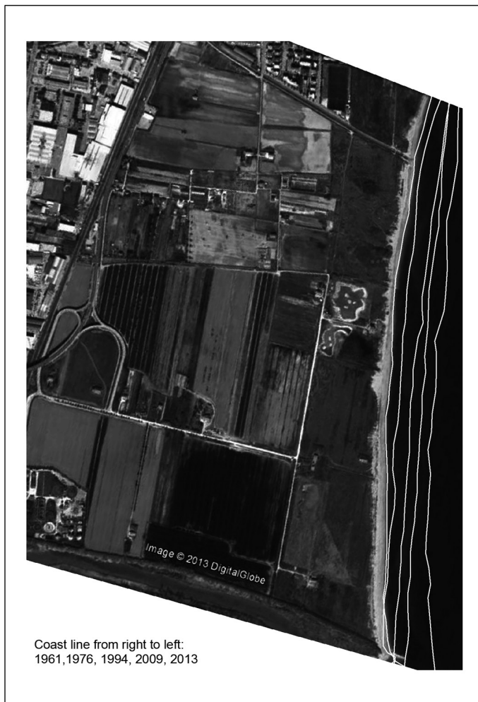
Fig. 8 - Evolution of the coastline of the 'Sentina' Regional Natural Reserve.

around 2 m/year, which increased to 3 m/year from 1994 to 2009, and increased again between 2009 and 2013, when it rose to 5 m/year.