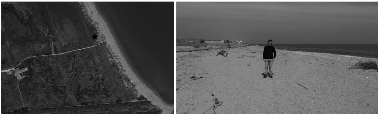
Fig. 6 - Right: Georeference point in which an example of Artemisia caerulescens subsp. caerulescens was re-introduced in 2013. Of note, at the time of planting, the site was part of the retrodunal area. Left: Photograph of the same point taken in spring of 2014, where the coastal erosion can be easily seen.

Until 2012, S. perennans subsp. perennans was the species that more than any other saw a quantitative reduction in its distribution. With respect to the distribution recorded in 2009, this decline occurred throughout the entire Natural Reserve. The populations that were recorded in 2012 were indeed significantly poorer in numbers of individuals and area covered. There are no longer any extensive populations of S. perennans subsp. perennans . At the moment, the space occupied by S. perennans subsp. perennans appears to be linked to the massive spread of H. portulacoides . Indeed, where a few years ago there were Salicornia , today there are dense populations of H. portulacoides . Locally, where H. portulacoides is more sparse, there is some space left for a few individuals of Salicornia . It should be