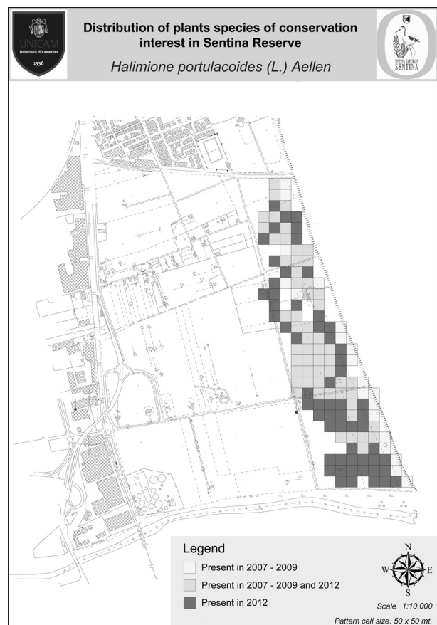
Fig. 4 - Distribution map of Halimione portulacoides in the 'Sentina' Regional Natural Reserve for 2007 to 2012.

Similar to the situation seen for E. juncea subsp. juncea , S. versicolor has shifted its sites towards the more inner areas of the Natural Reserve. Indeed, the plants that in 2009 were closer to the beach are no longer present today. In contrast, S. versicolor can now be found in the more internal sites where it was not